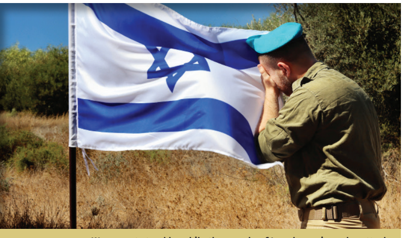
We cannot stand by while the people of Israel remain under attack.