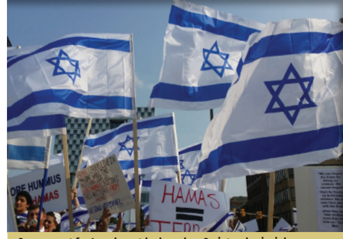
Our support for Israel must be based on Scriptural principles.

The convergence of the Iranian Revolution of the late '70s in the East and the coincident rise of the hard left in the West, although very different in nature, had a common enemy. Both sought the destruction, or at least subjugation, of Western Civilization, Judeo-Christian beliefs, the Bible, and God Himself. In fact, the modern State of Israel became a common target for both movements. While the western world would have historically stood up for such an ally in the Middle East, the increasing influence of the new left in the West distanced themselves from Israel and all that it represented. This greenlighted the plans and intentions of the radical jihadists, thus deepening the problems faced by Israel. That the West was willing to look the other way instead of pushing back on the violence of these radicals only emboldened Hamas and other militant groups to grow and continue to arm themselves, imposing